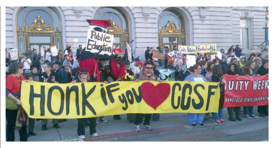
CCSF supporters take heart at a fall rally at San Francisco City Hall.

This article is excerpted from a significantly longer piece that ran in the October issue of CFT's CCC Perspective.